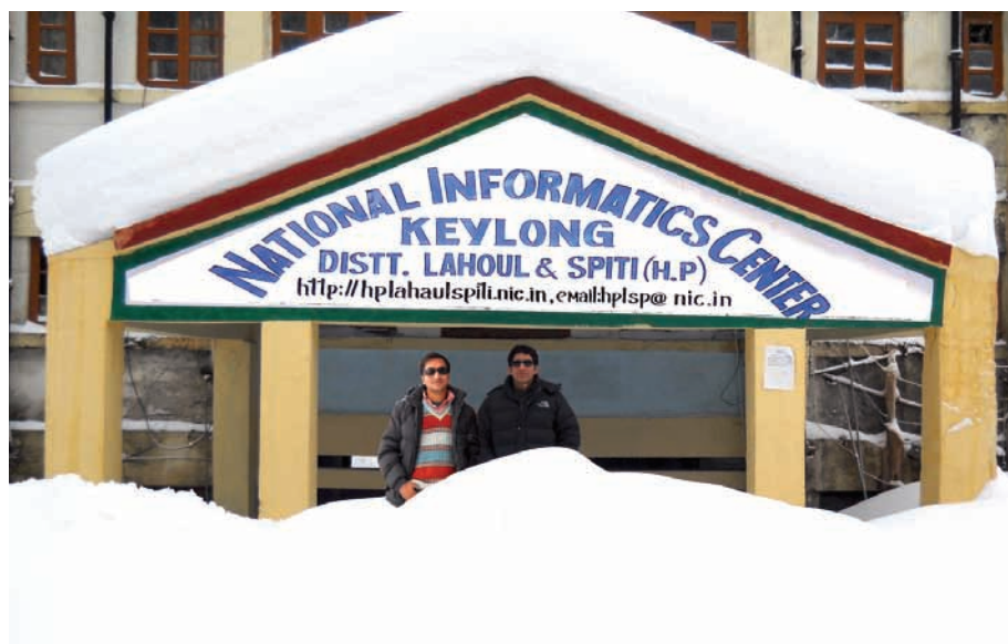
The DIO & DIA in front of District Centre, Keylong (Lahaul & Spiti), after heavy snowfall in February 2013

The e-Gazette, digital Raj Patra, is the