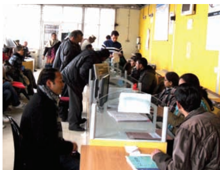
Citizens availing various online services at Sugam Centre, Shimla

The software, developed for 64 hotels of the HP Tourism Development